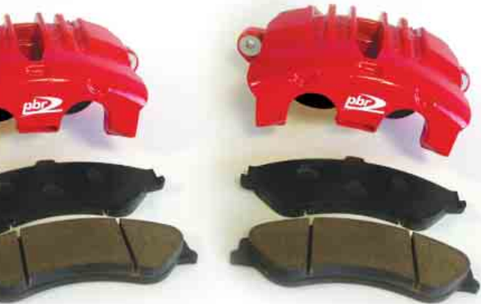
front caliper set shown